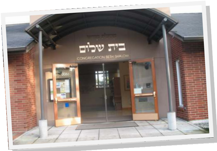
Our doors are open to new members!